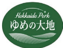
Yume-no-daichi (Dream Land)

promoting sales. Furthermore, we launched our overseas division and worked to cultivate new export markets for domestic beef such as Wagyu beef, and to popularize our company's branded beef. Last December, we added U.S. mid-size packer AURORA PACKING COMPANY, INC. to our group and strengthened our procurement network for high-grade U.S. beef. Going forward, we will promote Aurora Beef as an original brand throughout Japan and in Asian markets. In the food processing business, we have been enhancing cooperation with Foodlier Co., Ltd., which joined the S Foods Group the year