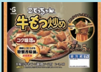
Kotetchan Beef Motsu Stir-Fry with rich miso flavor

You can also make horumon yakisoba (fried noodles with the internal organs of cow) by cooking the product together with noodles!