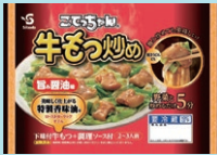
Kotetchan Beef Motsu Stir-Fry with rich soy sauce taste

The series has become more flavorful, with the use of rich beef motsu and a cooking sauce made with carefully chosen ingredients. A dish loaded with vegetables can be made easily with just one frying pan.