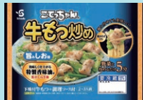
Kotetchan Beef Motsu Stir-Fry with rich salty taste