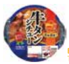
Beef Tongue Stew