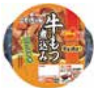
Kotetchan Beef Motsu Stew

This series comes with a microwave oven-compatible pot. Enjoy a stew by emptying the contents into the pot and heating it in a microwave oven.