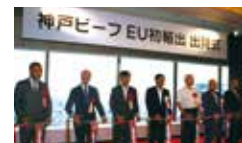
A departure ceremony marking the first shipment of Kobe beef to EU

In the food processing and wholesale meat businesses, we focused on expanding exports of Japanese beef. In July 2014, we exported Kobe-gyu (Kobe beef) to the European Union (EU), which we shipped overseas in 2012 for the first time, and then began exporting to Asian countries and the U.S. Meanwhile, in Japan, Foodlier Co., Ltd. (formerly known as Glico Ham Co.,